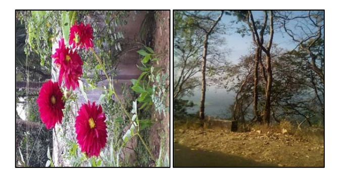
(a) (b) Fig 2: Examples of natural images that can be used as shares.

All visual cryptography techniques are different. None of them have same usage and each one is used for special purpose needs. Moreover, different implementations of the same cryptographic schemes will provide very different levels of security. Above discussed all schemes are different and have both merits and demerits. Comparison summary of different visual cryptography techniques is as follows.